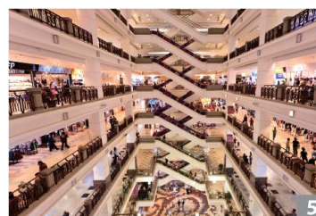
5. shopping mall