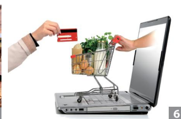
6. online retailer (chemist's)