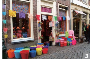
3. corner shop