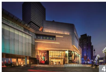
4. department store